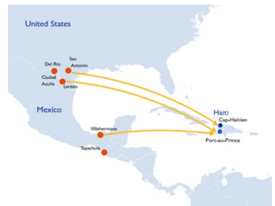
Figure 3. Return flights from United States and Mexico to Haiti