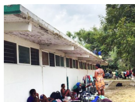
MIGRANTS IN MEXICO