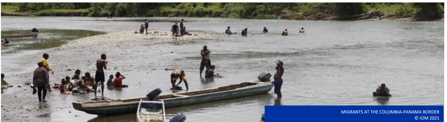
MIGRANTS AT THE COLOMBIA-PANAMA BORDER