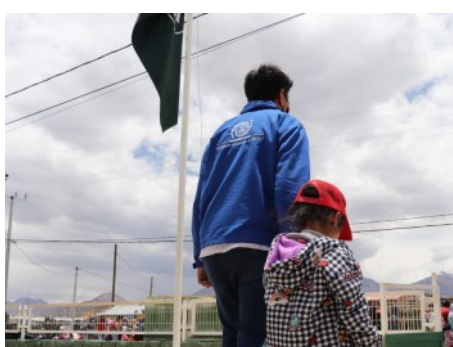
IOM STAFF GUIDES YOUNG MIGRANT IN CHILE