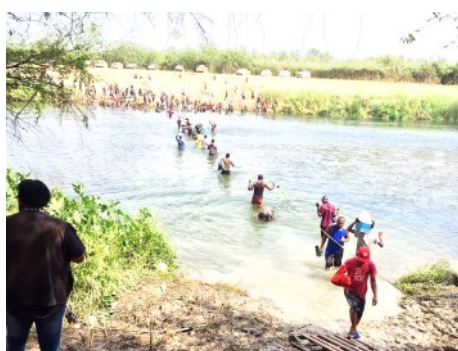
MIGRANTS TRANSITING IN MEXICO